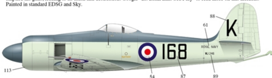
Hawker Sea Fury FB 11. WJ246 168 - K. 850 Squadron, Royal Australian Navy aboard HMAS Sydney during 1953, patrolling the waters off Korea postwar. Squadron disbanded shortly after and WJ246 struck off charge on December 17th 1956. Eventually scrapped. Not a standout service wise, but included as it can be built as a derelict airframe awaiting scrapping as a change of pace (see photo on stencil placement guide). Painted in Standard EDSG and Sky.